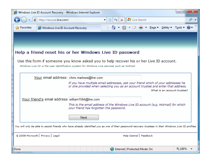
Figure 1. Initiation. Trustees enter their email address and the address of the account holder.

Whereas RSA's system is designed for primary authentication, ours is designed for last-resort authentication. We cannot assume that our users can contact a system administrator when all else fails. Whereas RSA's system requires users to select a helper (trustee) who has an account on the same system, ours requires only that trustees have email addresses.