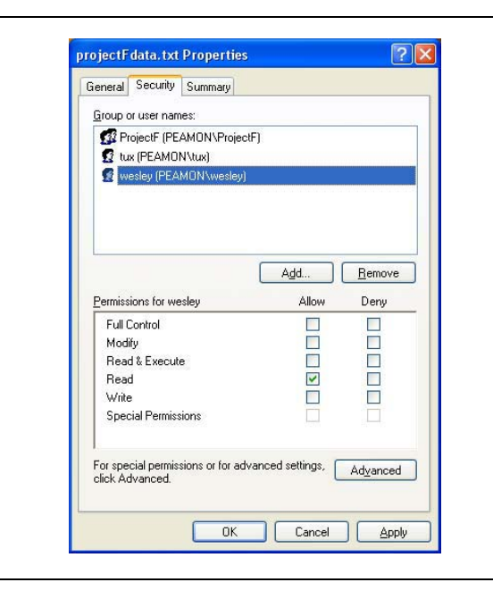
Figure 1: The XPFP interface. The interface contains information and functionality for setting permission values, but effective permissions, group-inherited permissions, and ADMINISTRATE permissions are not visible.

multaneously is impossible. When users return to changing permission values, the effective-permissions display disappears. Users need to know the effective permissions to check their work. Without an effective-permissions display readily available, or even a cue to indicate their importance, users are forced not only to maintain in their minds the inheritance and precedence rules, but also to compute the effective permissions mentally.